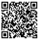
2 MIN CLIP